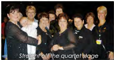
Straight off the quartet stage

Later in the year, Perth Harmony were off again to America to compete. They were looking forward to revisiting New Orleans exactly ten years after their first appearance there. However, with the devastation of Hurricane Katrina less than a month before, there was concern about whether the Convention might be postponed or even cancelled. Amazingly, International Headquarters did manage to reorganise and 'save the day' by moving it to Detroit.