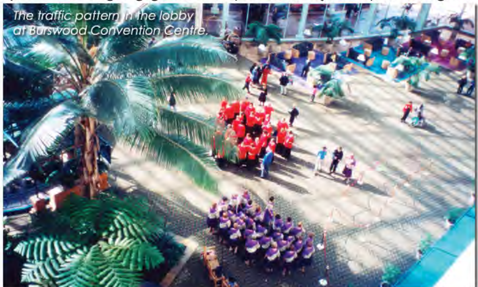
The traffic pattern in the lobby at Burswood Convention Centre.