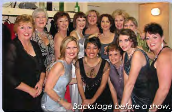
Backstage before a show.

Our ultimate chorus goal is to be the immediate 'MUST HAVE' group of singers/entertainers any Events Coordinator thinks of when a significant event is being programmed on the Sunshine Coast.