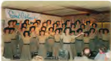
PHC prepare for Australia's International debut in Hawaii, 1987