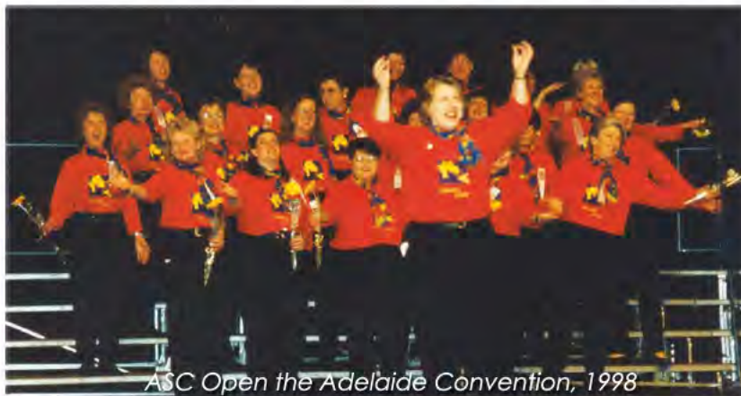
ASC Open the Adelaide Convention, 1998

Future aspirations for our Chorus include a visit to New Zealand, adding to our membership and taking our contest score to 600 and beyond. Our experiences of the past few years have taught us that nothing within our imagination is beyond our reach so watch out for big things from Bathurst Panorama Chorus!