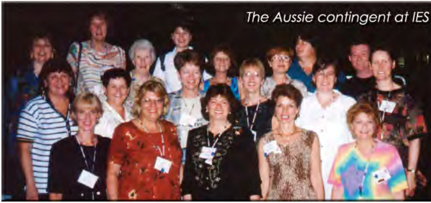
The Aussie contingent at IES

On the membership scene, Wollongong Harmony was again recognised by International for their membership growth and retention, and two new choruses, Manning River Harmonies in Taree, NSW and Ballarat Sovereign In Victoria both chartered.