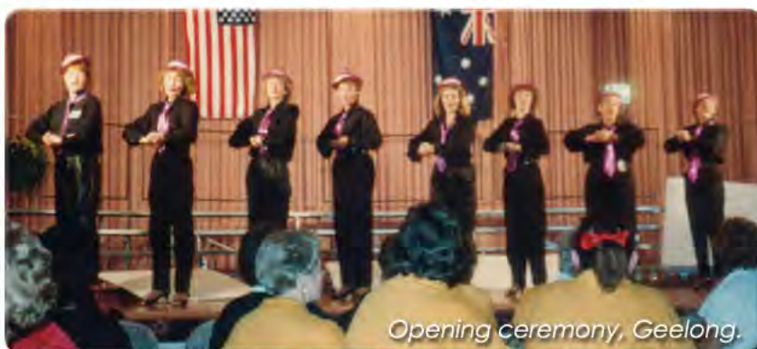
Opening ceremony, Geelong.

As well as choruses there were eight quartets competing and one being evaluated. Mischief Down Under from Perth won their first of many gold medals, Blue Rhythm placed second and Alliage placed third.