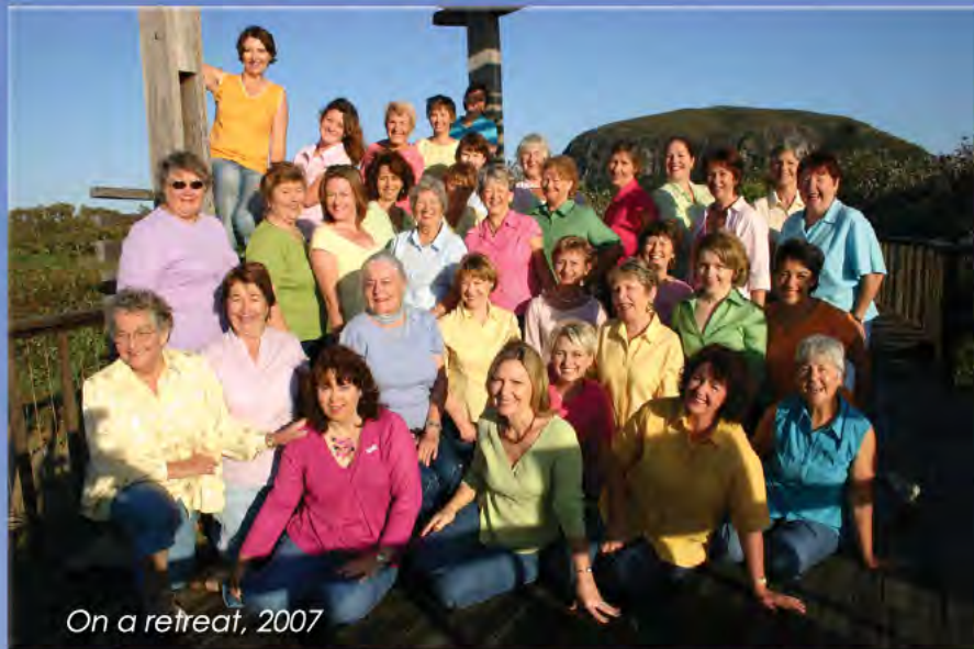
On a retreat, 2007