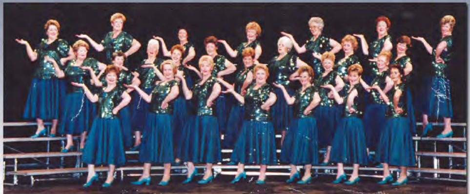
Yarra Ranges, 1998