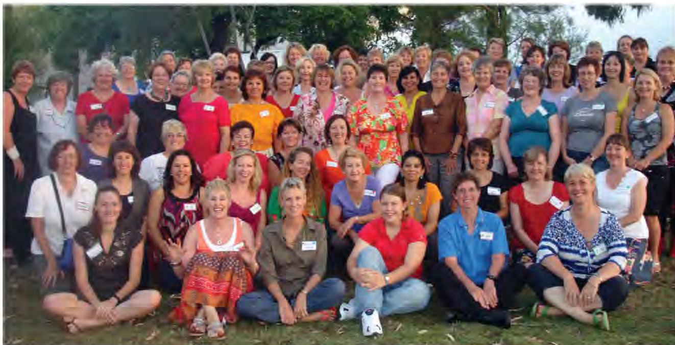
ACW members join with Vocal Course participants in early 2009.