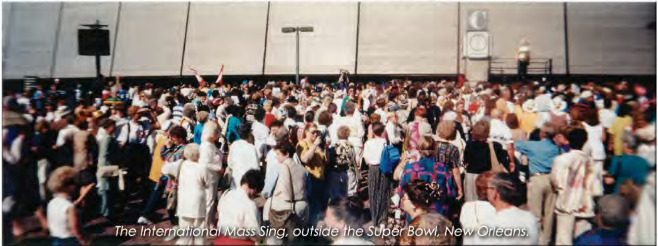
The International Mass Sing, outside the Super Bowl, New Orleans.

Once again the performance of an experienced chorus, in this case Melbourne, had captured the fancy of a group of women and led to the chartering of Wagga Wagga Harmony Chorus in May of this year. They would later change their name to Murrumbidgee Magic.