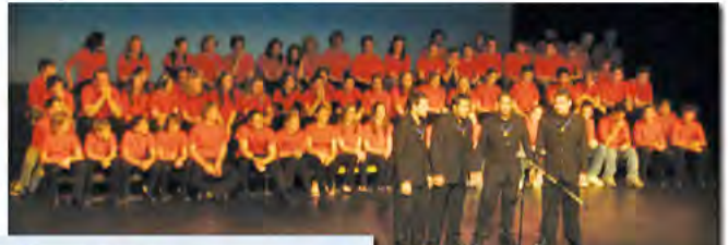
Musical Island Boys, 2006