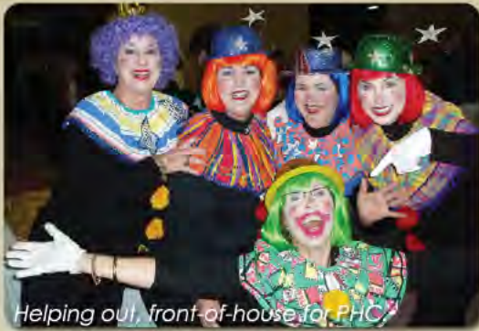
Helping out, front-of-house for PHC

"Oh My Darling Clementine, you are lost and gone forever".....the words whirled in my brain after my decision to retire after a wonderful 20 years with PHC. I learnt that a grieving period was common amongst those who had left the chorus, and I determined to direct my energies into maintaining the fantastic friendships made over so many years! With the generous support of Perth Harmony a social group for past members was created in 2005 - the name had to be Clementines. We maintain a loving interest and communication with PHC, supporting them when needed. PHC provides Clementines with the names of those who leave the chorus.