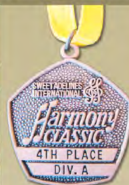
Harmony Classic, San Antonio 2007