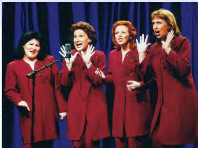
Accolade compete at International

Another special feature of Convention this year was the presentation of the Inaugural Quiet