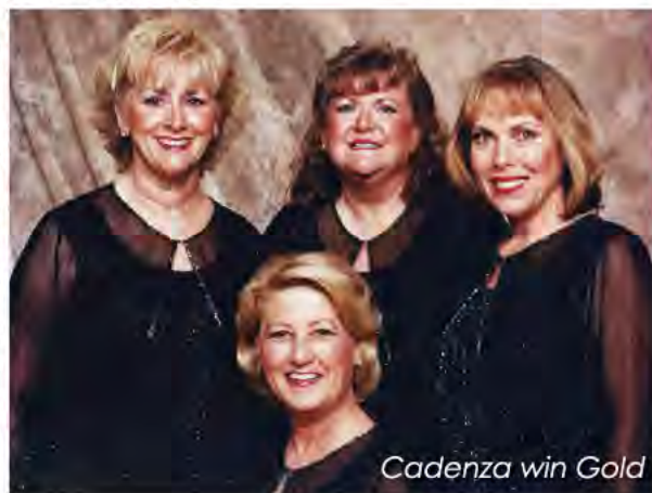
Cadenza win Gold

Sadly, in December, Manning River Harmonies and the twice Small Chorus Champions, Avon Valley Harmony, made the difficult decision to dissolve. Avon Valley Harmony specifically requested that their resources and remaining funds after dissolution be set aside for small struggling choruses. As a result, the Regional Small Chorus Fund was initiated for this purpose and eligible choruses invited to apply for grants.