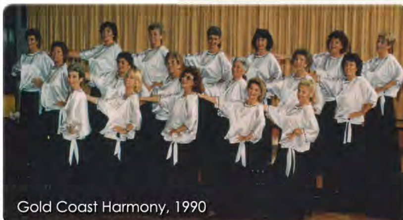
Gold Coast Harmony, 1990

The Australian Area was well on its way to becoming a force in the International Sweet Adeline world!!