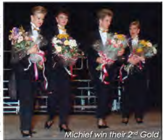
Mischief win their 2 nd Gold