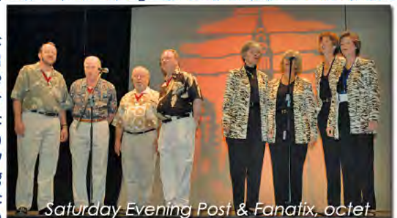
Saturday Evening Post & Fanatix, octet