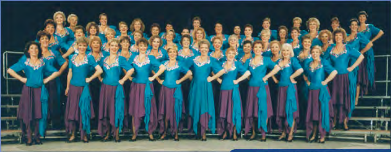
Perth Convention, 1992