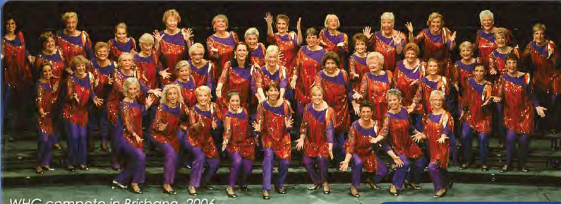
WHC compete in Brisbane, 2006