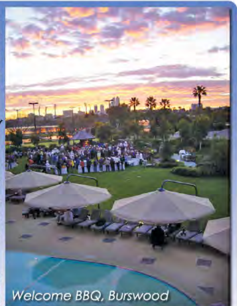
Welcome BBQ, Burswood

How can one comment on the most amazing five days of education, musical excellence and commitment I have experienced since becoming a member of Brindabella chorus and a Sweet Adeline? I have never experienced such generosity and sharing of our Craft between both men and women at every stage of barbershop skill level. We had so much fun! It was JUST FABULOUS!!