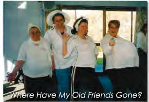
Where Have My Old Friends Gone?

The dissolution of Spirit of Sydney and Kanyana