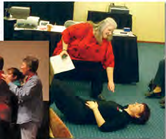
by Bathurst Panorama who