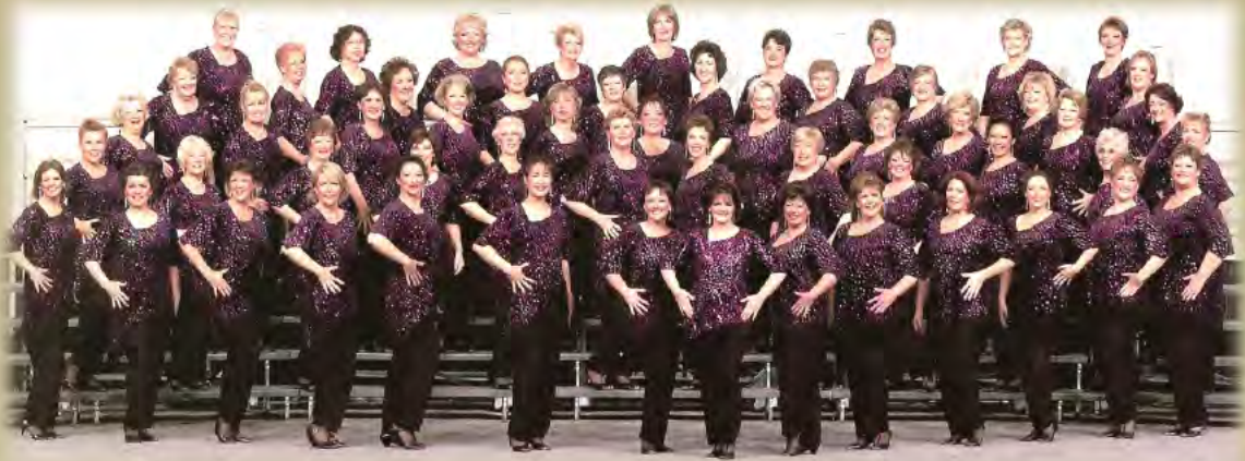
Las Vegas, 2006