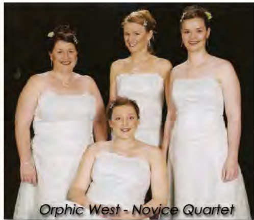
Orphic West - Novice Quartet