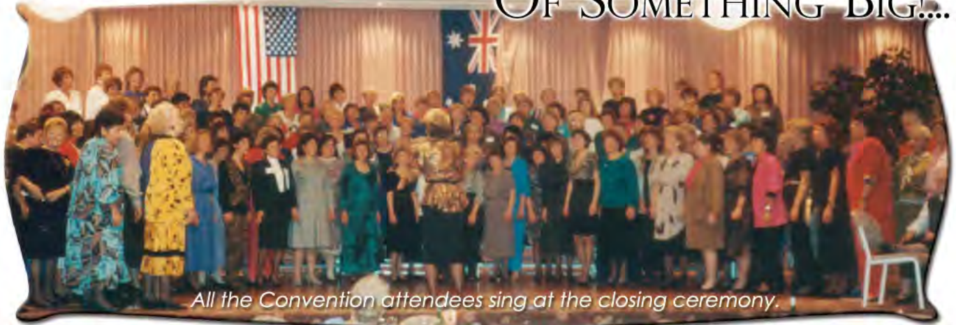
All the Convention attendees sing at the closing ceremony.