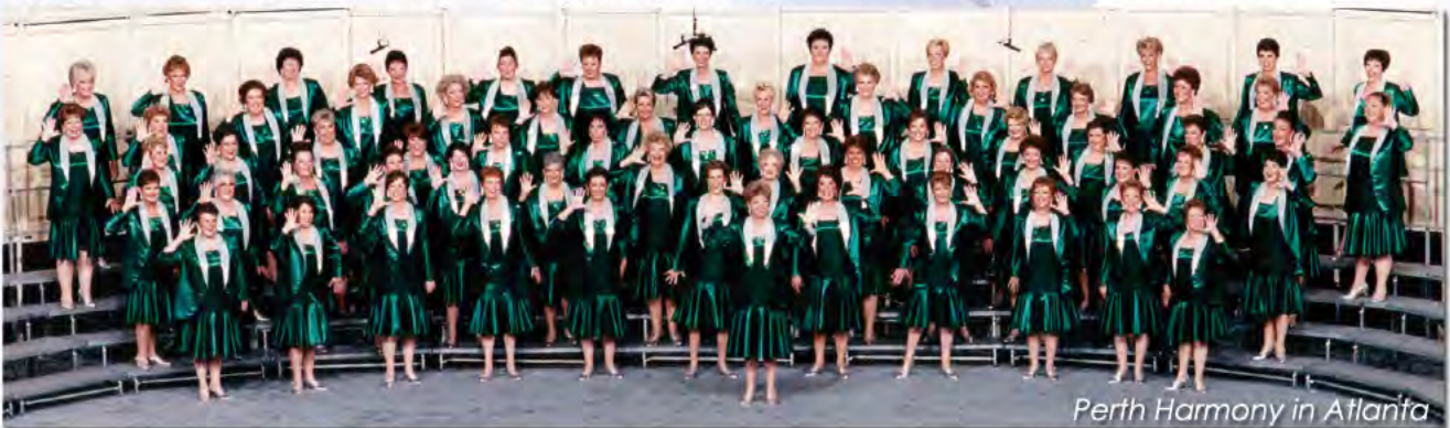
Perth Harmony in Atlanta