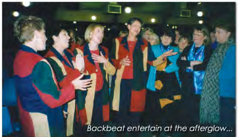
Backbeat entertain at the afterglow...

Another educational initiative by International was to fund all members of RMTs in all regions to attend IES in July. General leadership classes as well as those aimed at specific roles on the team