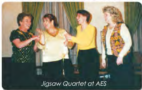
Jigsaw Quartet at AES