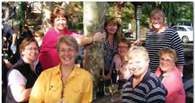
The Regional Management Team

In the spirit of our anniversary, the incoming 2009-2010 Team will not only look at where we have been but we will set a course for the future of Sweet Adelines in Australia. We are pleased to be providing our members with fresh ideas, new opportunities, better education, new competition venues and even a fresh new logo and colour scheme. These positive changes were a result of direct membership feedback. You spoke and we listened. With a new era comes new energy and new perspectives. We all have much to be thankful for and much to look forward to over the next two decades.