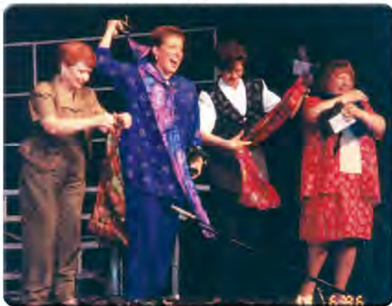
Our judges find out what a 'pressie' is...

Affectionately known as 'The Wendy' this award is presented to the novice quartet scoring highest at Region 34's annual competition.